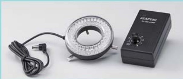
LED-60 Adjustable LED ring illuminator

Note: KA-9 is optional for Model SLG-500A, DLG-500A, SLG-500B and DLG-500B.