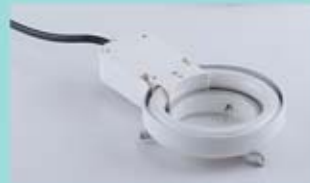
FRL-8 8W fluorescent ring illuminator