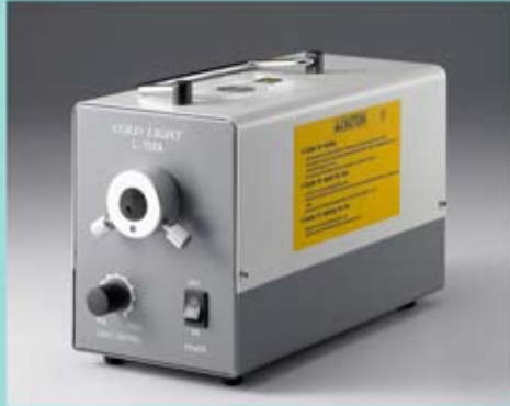
Type A power supplier Power: 110V/220V switchable Size: 280x120x170mm Housing material: metal Equipped with automatic power off device in lamp housing.