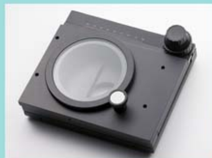
MS-H43 Stage size: 180x155x43mm Moving range: 75x55mm with graduation of 0.1mm Connecting size: Diam. 95mm Glass plate: Diam. 95mm & 360 degree rotatable