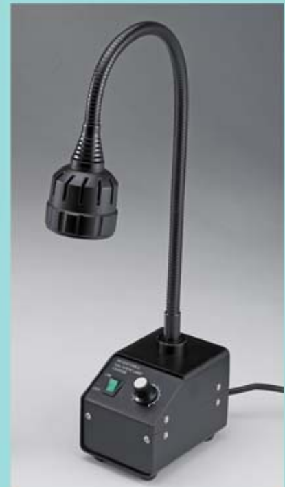
HL-20 Adjustable 12V20W halogen lamp