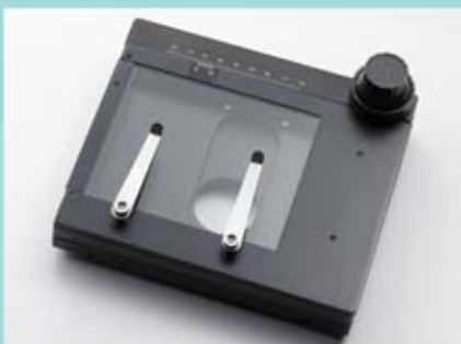
MS-H26 Stage size: 180x155x26mm Moving range: 75x55mm with graduation of 0.1mm Connecting size: Diam. 95mm