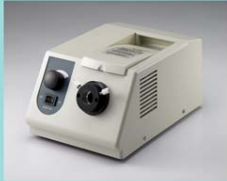
Type B power supplier Power: 85V~265V switching power Size: 265x170x135mm Housing material: ABS plastic Adopt over loading protect set on PC board.