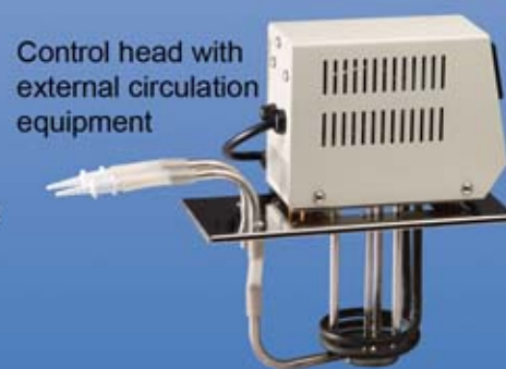
Control head with external circulation equipment