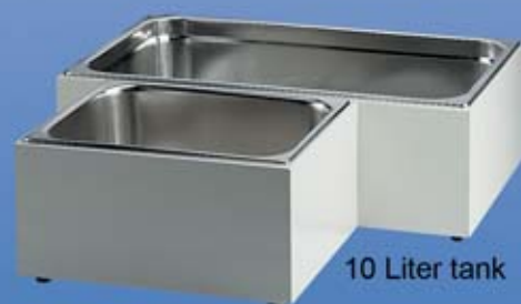
10 Liter tank

Power supply: AC 110V 60Hz (220V 50/60Hz available)